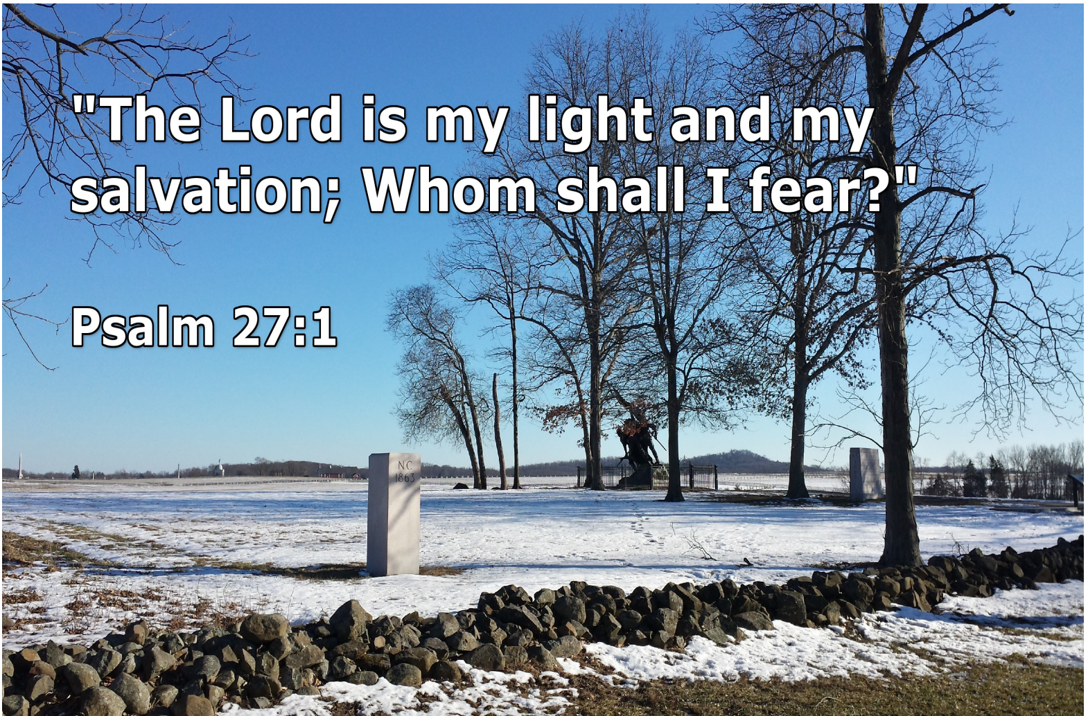
Winter Scene - Gettysburg NMP North Carolina Memorial